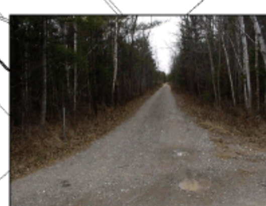
7 K&P Trail - geographic Township of Bagot Intersection of Murphy Road and K&P Trail View south from Murphy Road (0890)