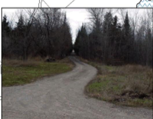
8 K&P Trail - geographic Township of Bagot Intersection of Ashdad Road and the K&P Trail View to the south from Ashdad Road (0930)