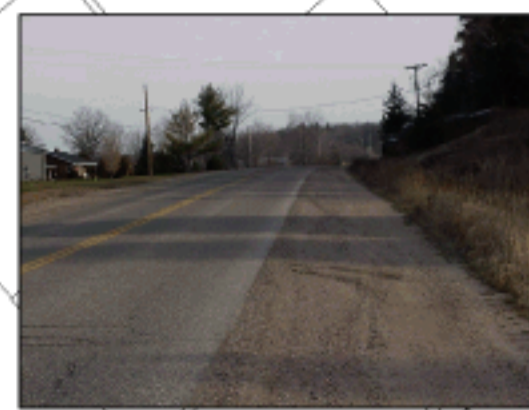
19 K&P Trail - geographic Township of Admaston Intersection of Highway 132 and K&P Trail View to the east along Highway 132 (0894)