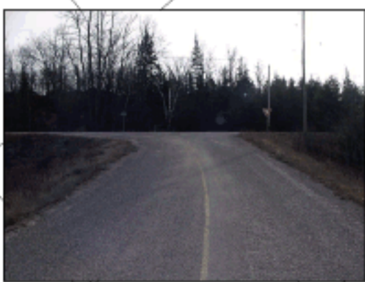
16 K&P Trail - geographic Township of Admaston Intersection of Kunopaski Road and K&P Trail View to the east along Kunopaski Road (0950)