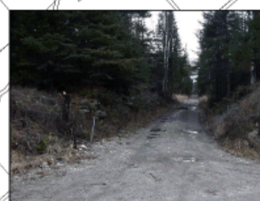
11 K&P Trail - geographic Township of Bagot Intersection of Pucker Street and K&P Trail (0816)