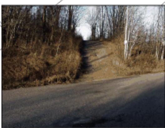
14 K&P Trail - geographic Township of Admaston Intersection of Fergusie Road and the K&P Trail View north from Fergusie Road (0887)