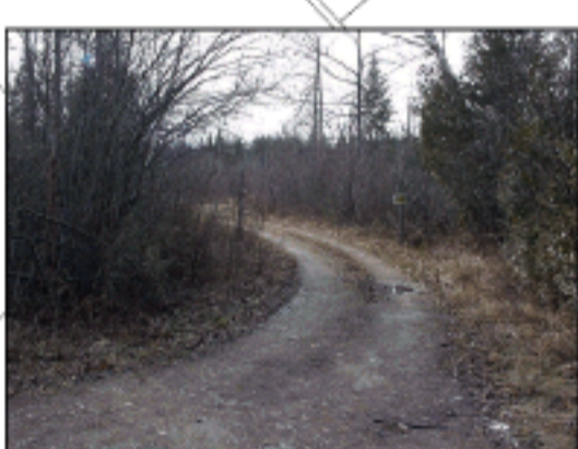
10 K&P Trail - geographic Township of Bagot Crossing over K&P Trail View to the west (0828)