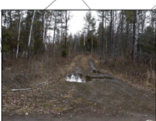
4 K&P Trail - geographic Township of Bagot Private crossing over K&P Trail East View (0958)