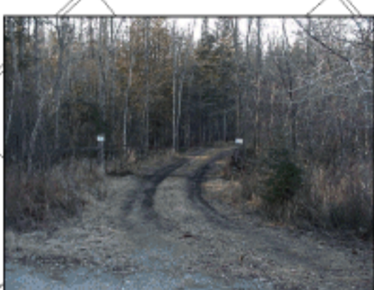
13 K&P Trail - geographic Township of Admaston Private crossing over K&P Trail View to the West (0847)