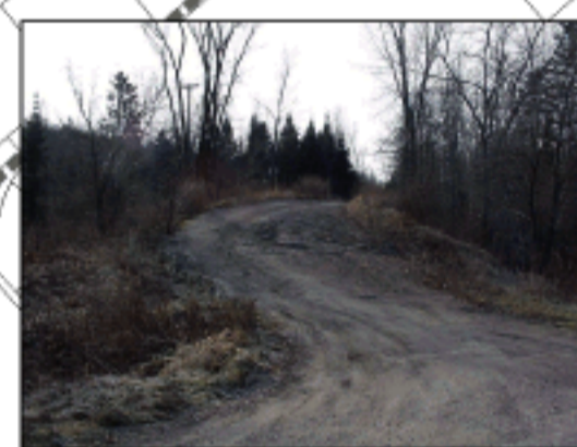
15 K&P Trail - geographic Township of Admaston Intersection of Fergusie Road and the K&P Trail View south from Fergusie Road (0914)