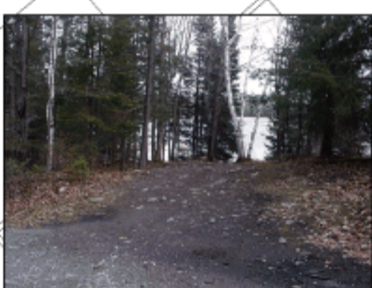
12 K&P Trail - geographic Township of Admaston Private entrance off of east side of K&P Trail to Miller Lake View to the East (0817)