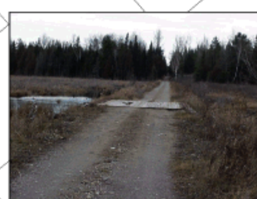
9 K&P Trail - geographic Township of Bagot Wood & Mason Bridge on K&P Trail View to the north (0820)