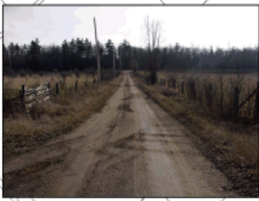
20 K&P Trail - geographic Township of Admaston Intersection of McLaren Road and K&P Trail View to the east along McLaren Road (0846)