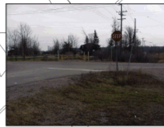
21 K&P Trail - geographic Township of Admaston Intersection of Riverview Drive, Highway 132 and K&P Trail View to the east from K&P Trail (0644)