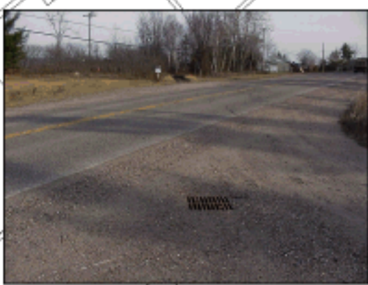
18 K&P Trail - geographic Township of Admaston Storm Drain in Middle of K&P Trail at Intersection with Hwy 132 Northeast View (0678)