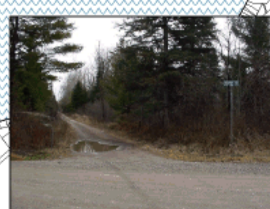
5 K&P Trail - geographic Township of Bagot Entrance to K&P Trail from Calabogie (City Rd 501) Looking south from Calabogie Road (089A)