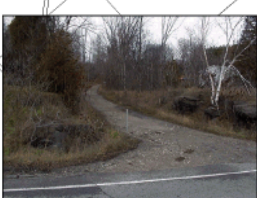
2 K&P Trail - geographic Township of Bagot Entrance to K&P Trail from Lanark Road (City Rd 511) Looking north from Lanark Road (0864)