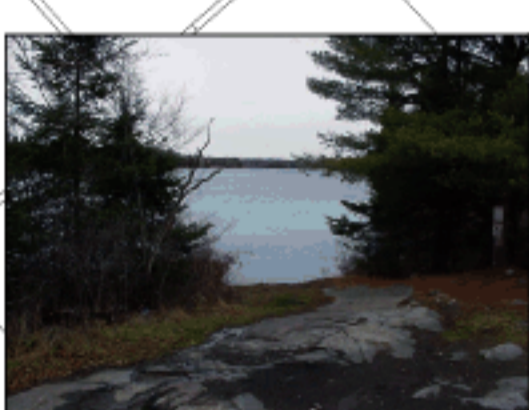
6 K&P Trail - geographic Township of Bagot Private access off east side of K&P Trail to Norway Lake View to the East (0860)