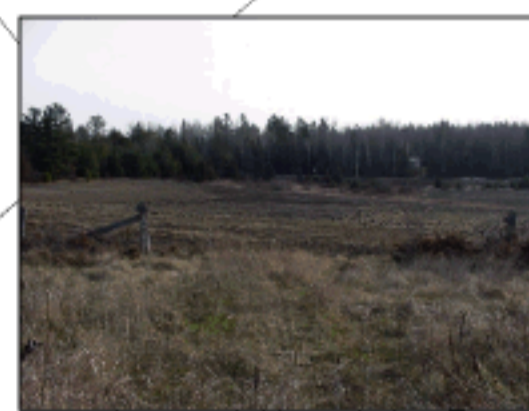
17 K&P Trail - geographic Township of Admaston Private crossing over K&P Trail View to the East (0914)